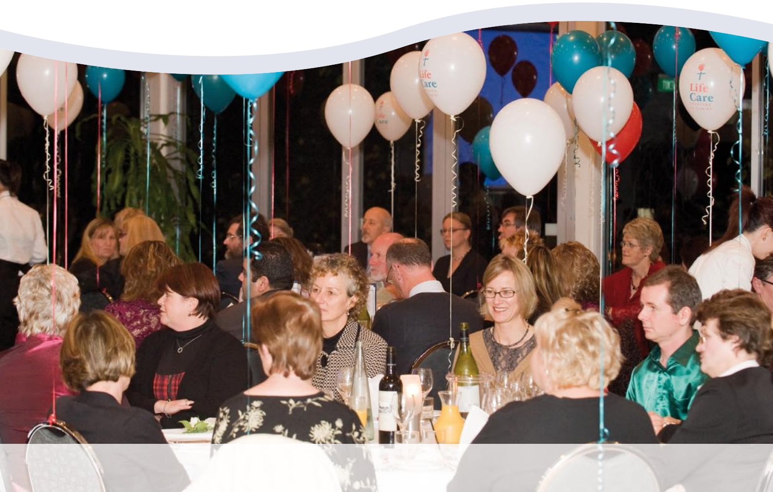
Enjoying the 2009 staff awards dinner