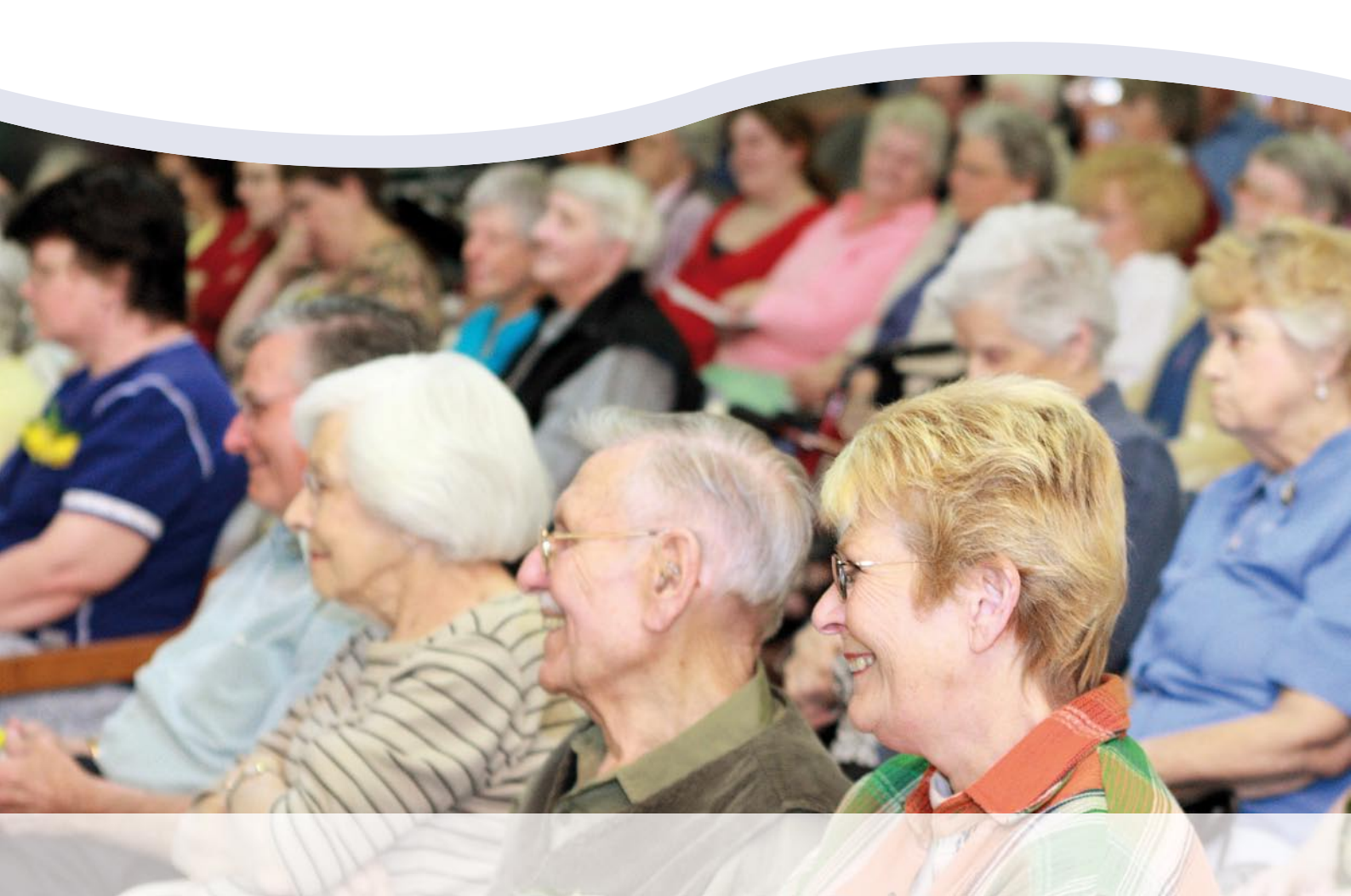
Parkrose Village residents and visitors enjoying the performance of Urban Myth with the actors in full flight below