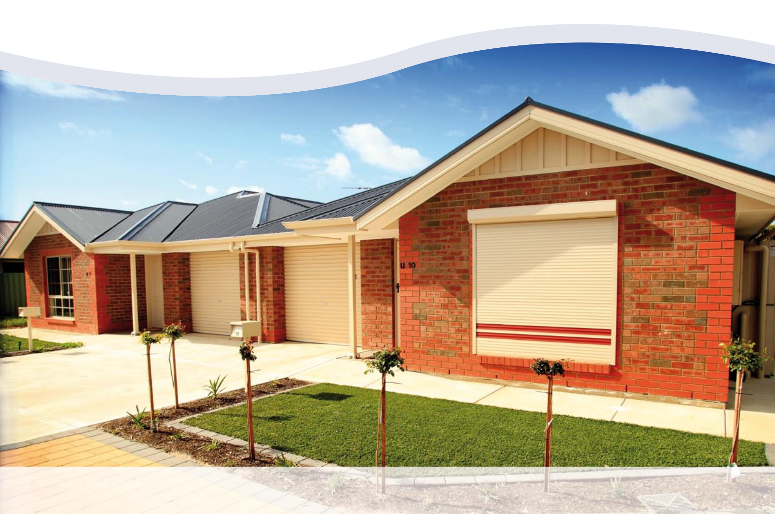
New homes at Aldinga Beach Retirement Village